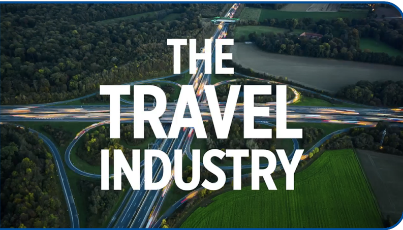
Video to promote National Travel & Tourism Week

U.S. Travel Association is a national non-profit organization representing and advocating for all components of the travel industry. They have been investing in video over the last few years to help promote the organization's events and original content on Facebook, Instagram, and LinkedIn. Since 99% of their video is created in-house, they needed a robust solution to help them produce a high volume of video content quickly.