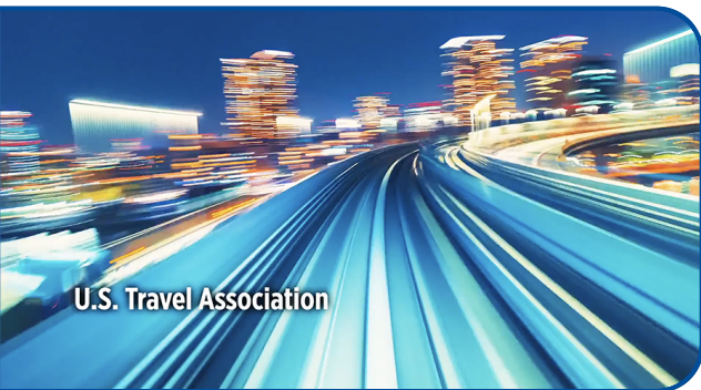
The Future of Travel is Now campaign video

"It works incredibly well. It's been a great asset, just having that easy, seamless plugin on your OS. "